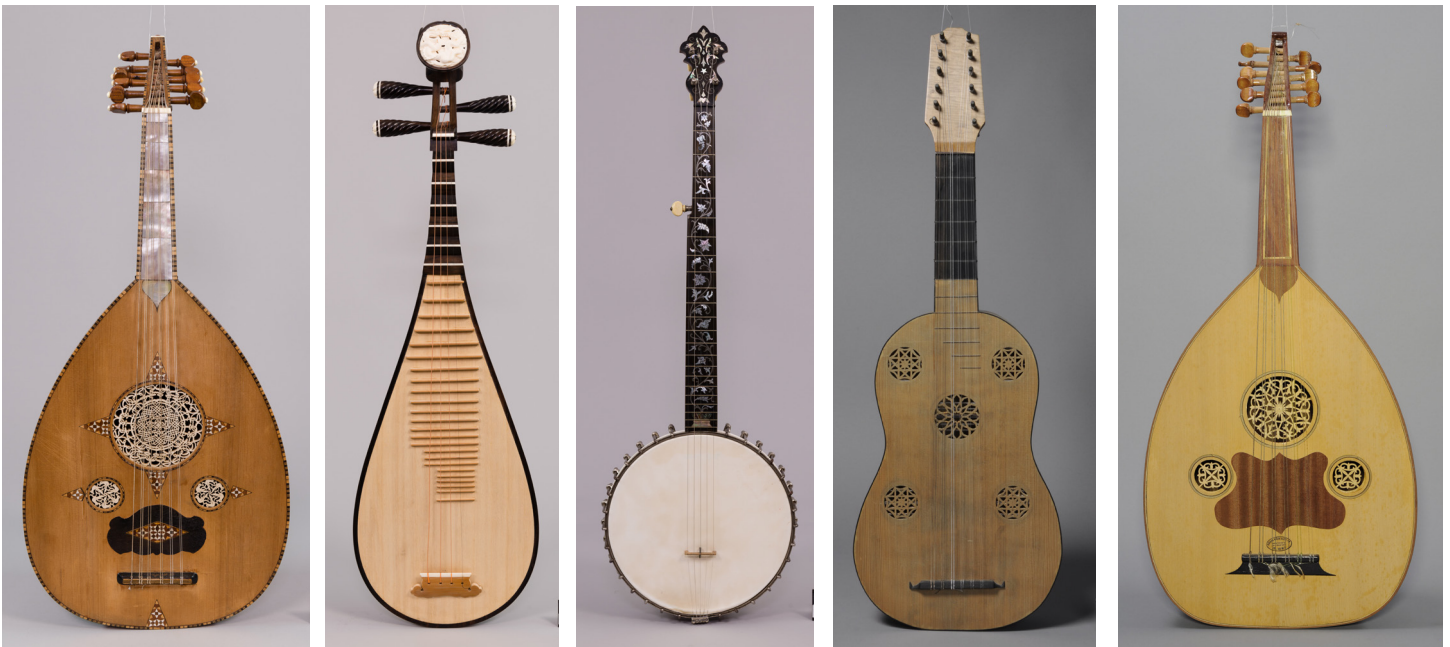
Plucked lutes exist throughout the world in forms that have been adapted to suit local tastes.

Present students with a stack of Post-it notes and request that they respond to the following questions on separate Post-it notes: