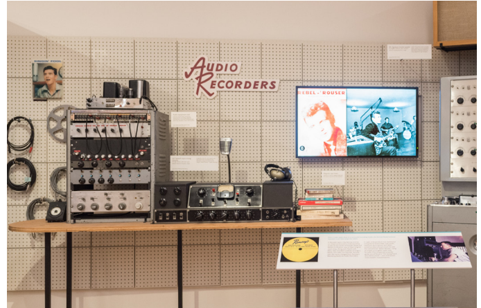
Recording technology has had an enormous impact on how people participate in listening to music.

The Arranging Piano was invented to preserve “samples” by well-known musicians playing popular music. A player sat down at the piano and played a tune, while an apparatus attached to the piano marked a paper roll with the key strokes of the player. Afterward,