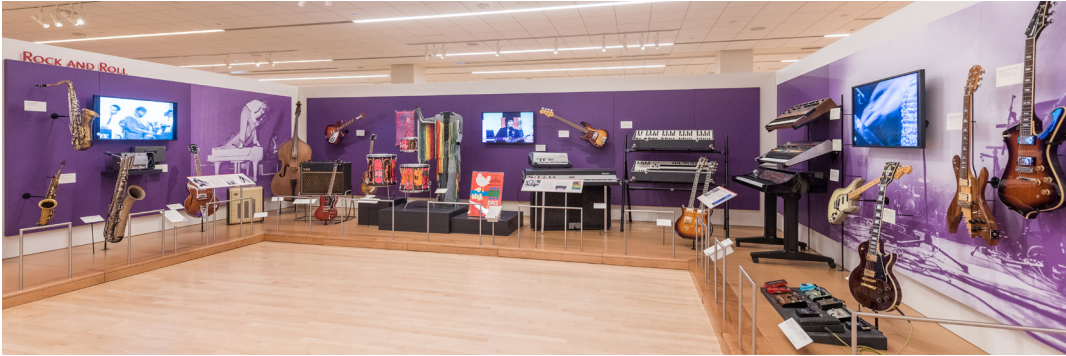
Electric guitar technologies significantly impacted the development of rock and roll.

The entire Mechanical Music Gallery represents, in certain respects, a desire to create music on demand, whether or not skilled musicians were available to create that music.